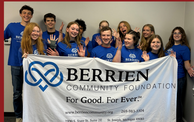
T.E.A.M. members at their first meeting of the school year.

If you know a teen who might be interested in joining, visit www.berriencommunity.org/TEAM for more information!