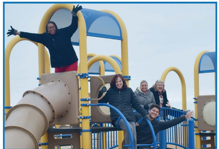
BCF staff take a break from the workday to show their support of replacing the playground equipment at Silver Beach County Park to create a more inclusive place.

BCF is working with the county parks department